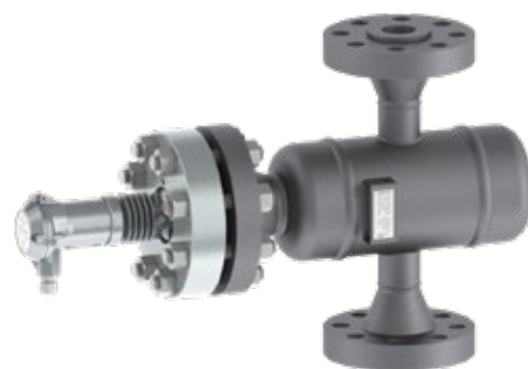
Trimod Besta level switch type: HAA 22C01 041