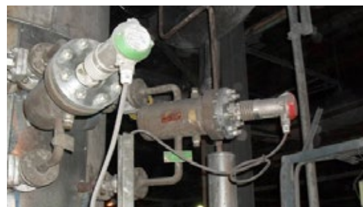
Trimod Besta float chamber type: I021-1C0RC1